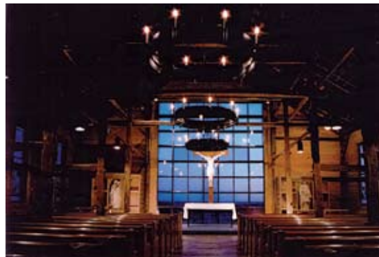
Evening view of the Chapel of the Good Shepherd at Our Lady's Farm, Falmouth, Kentucky.

This ministry shall be my hands and my feet and walk amongst my children and minister to them and nourish them, both in body and in spirit.