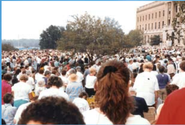
Thousands attend the 3rd visit of Our Lady of Light, Aug. 31, 1995 at Our Lady of the Holy Spirit Center.

† Our Lady of the Holy Spirit Center, Cincinnati, Ohio. My House has always been a holy place and now I request that it be a safe refuge for all of my children in these days of darkness and that it be a place of peace. Our Lady of Light Ministries should also be centered here so that all work together, just as your fingers are joined to your hand.